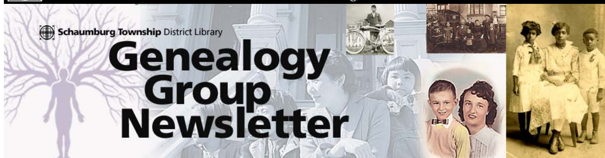
TABLE OF CONTENTS April 2011 --- No. 187

SCHAUMBURG TOWNSHIP DISTRICT LIBRARY 130 South Roselle Road ■ Schaumburg, IL 60193 ■ (847) 985-4000