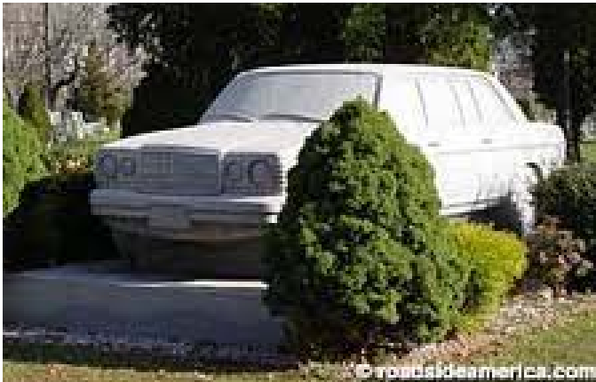
(Above) Another Car, Not Just A Car, A Mercedes!