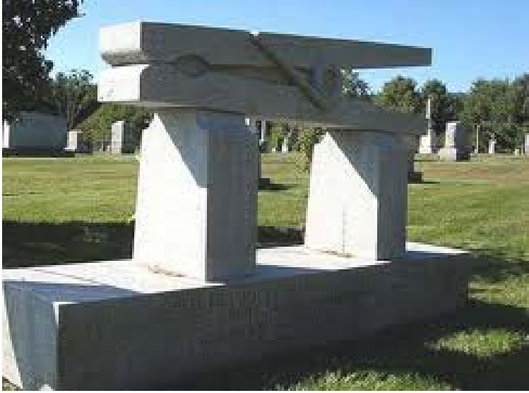
(Above) That Is A Clothes Pin! I Sure Wish I Knew the History of This Deceased Person!