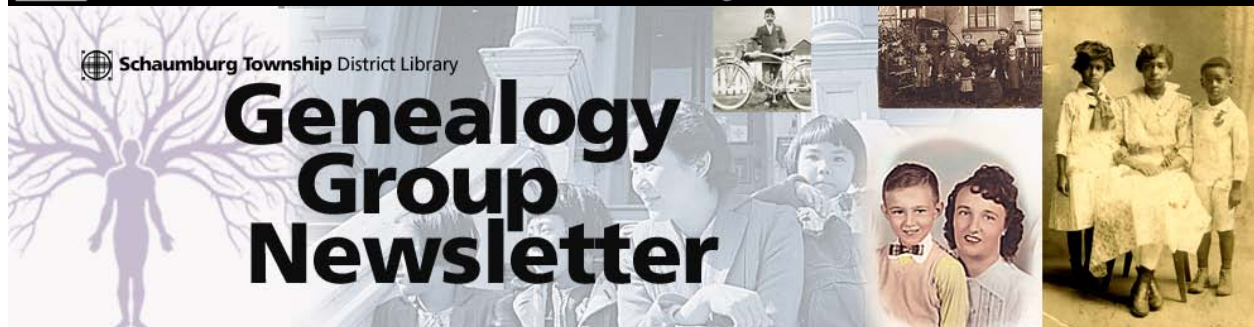
TABLE OF CONTENTS June 2011 --- No. 189

SCHAUMBURG TOWNSHIP DISTRICT LIBRARY 130 South Roselle Road ■ Schaumburg, IL 60193 ■ (847) 985-4000